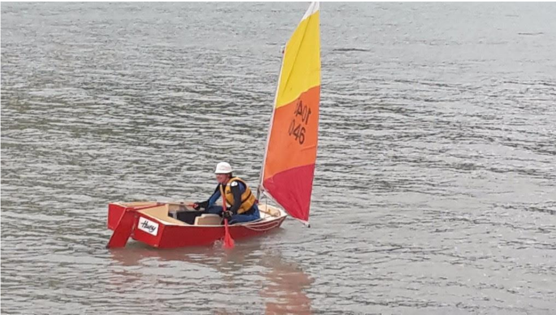
Pugwash Trophy Champion